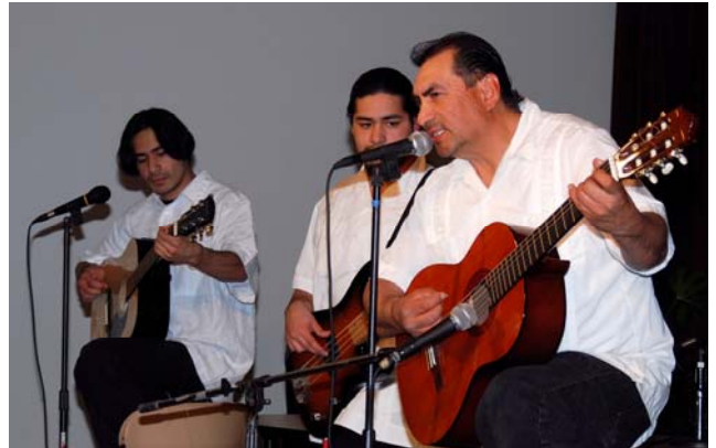
Trio Irecha inspires with Pu'repechan songs

One goal of the Assembly was to tackle divisive stereotypes about immigrants, like the idea that immigrants "steal American jobs!" Another goal was to redirect people's focus from questions of legality (people not having papers) to the economic reality shared by all workers. Real wages have been falling steadily since the 1970s and the gap between the "haves" and the "have not's" has grown enormously. Dialogues at the Assembly focused on workers' common frustrations with employers rather than on complaints workers (with or without papers) have about each other.